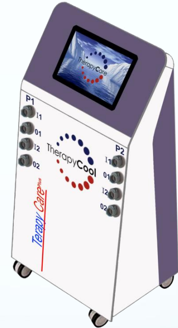
Therapy Care Plus

Equipment for carrying out heat applications, cold applications and thermal contrasts, (contrast in less than 1 min), with active hydraulic compression massage.