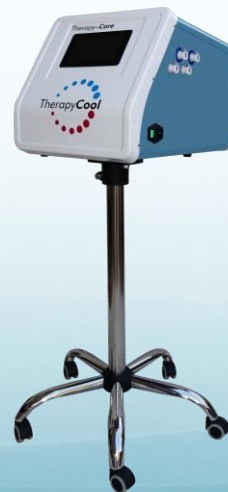
ADC Direct Applicator of Contrasts