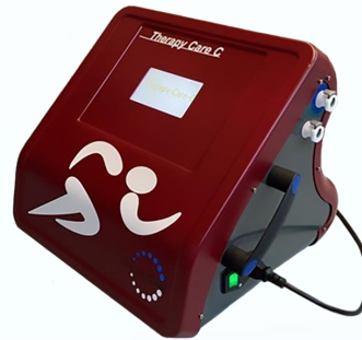
Therapy Care C Only cold and compresion, portable equipment - All cold power without ice - Cold without limit